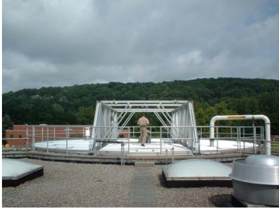
Examples of flat aluminum plate covers with external reinforcement