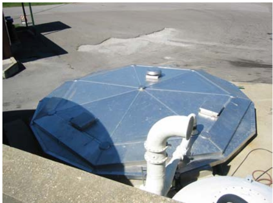
Examples of aluminum dome covers