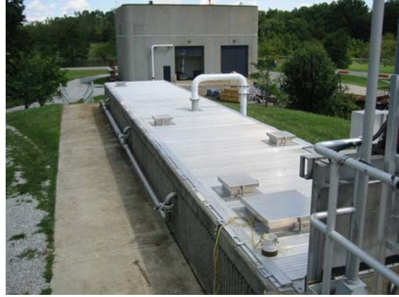
Examples of flat aluminum plate covers